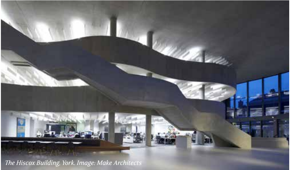
The Hiscox Building, York. Image: Make Architects